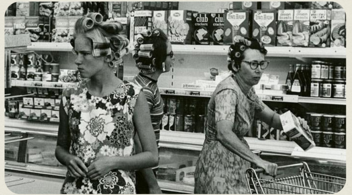
At the grocery store in the 1960s.

After realizing that poor women were using the flour sacks to make clothing for their children some flour mills started using flowered fabric for their sacks, 1939.